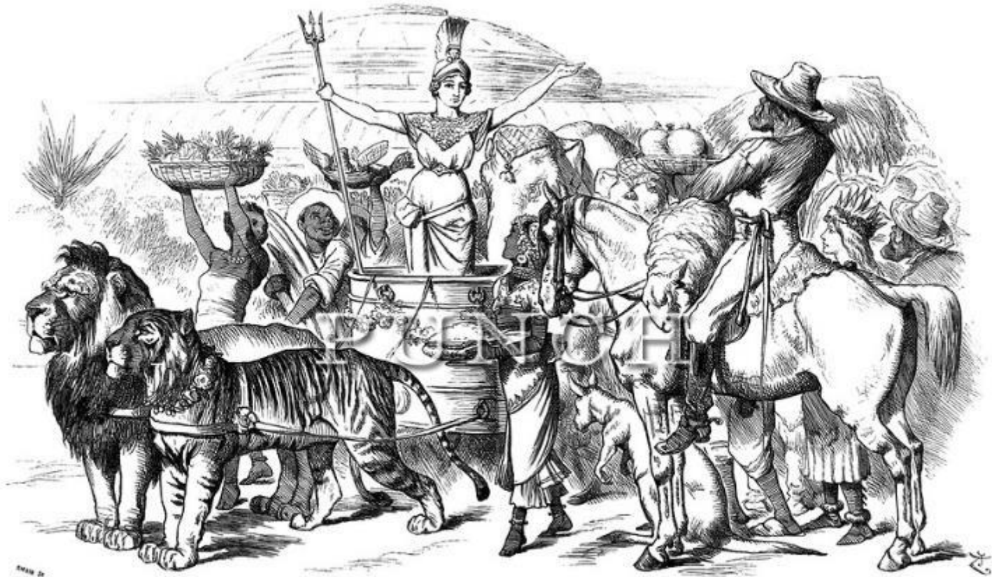
HAIL, BRITANNIA! (OPENING OF THE COLONIAL EXHIBITION, MAY 4.)