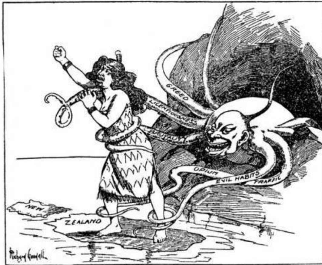
THE YELLOW PERIL.