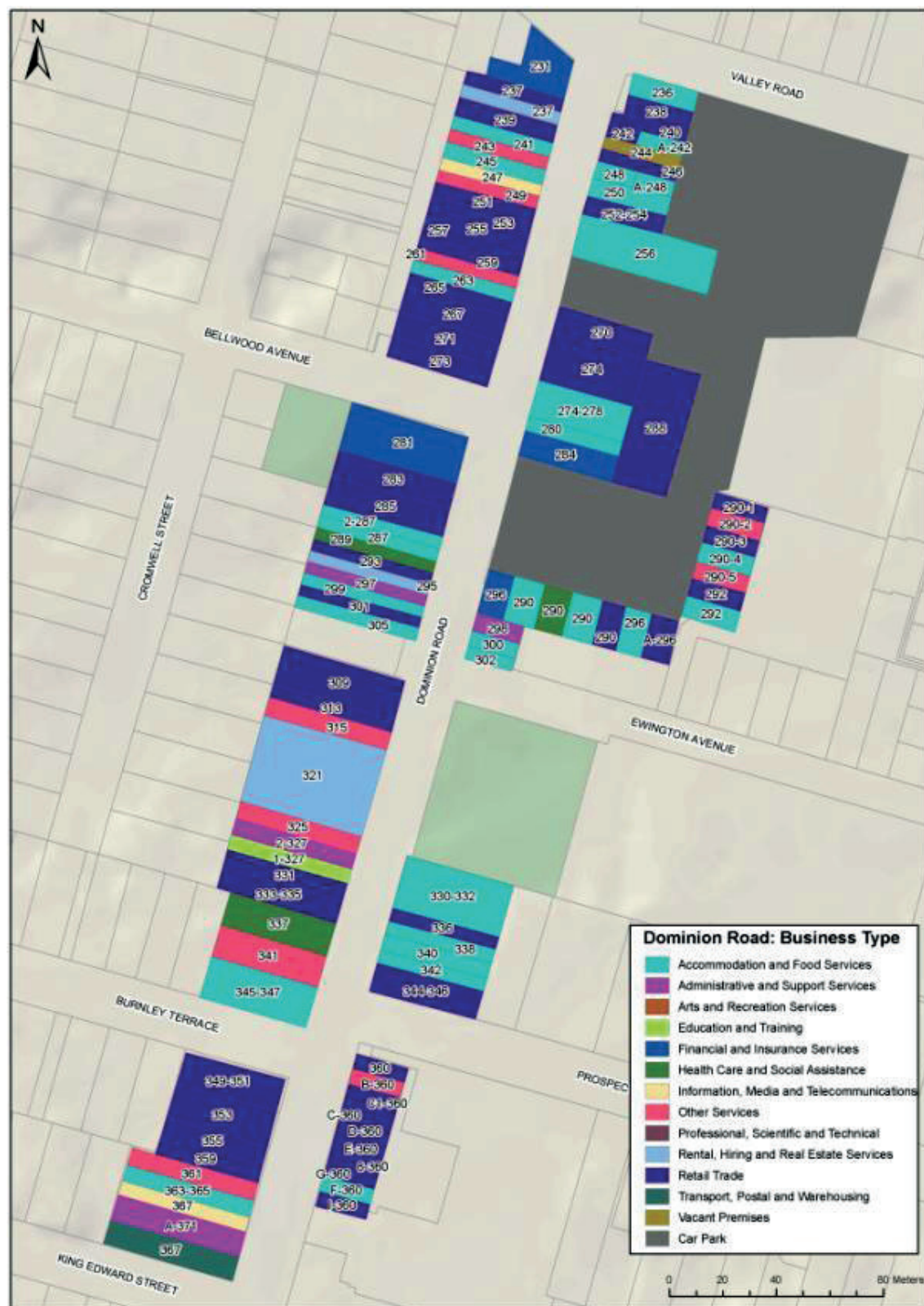
Map 1: Classification of business types along Dominion Rd