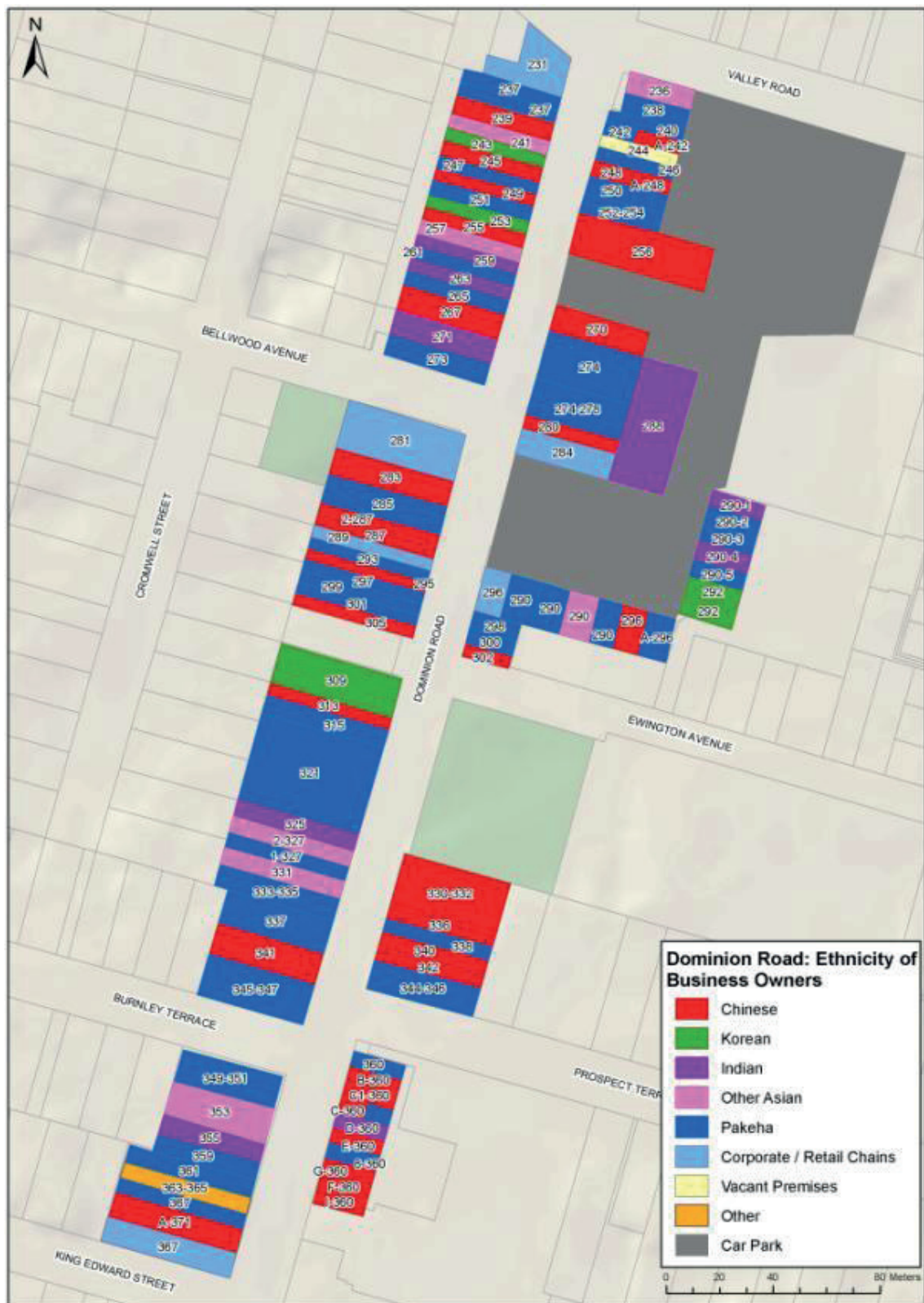
Map 2: Classification of businesses by ethnicity of owners/operators along Dominion Rd